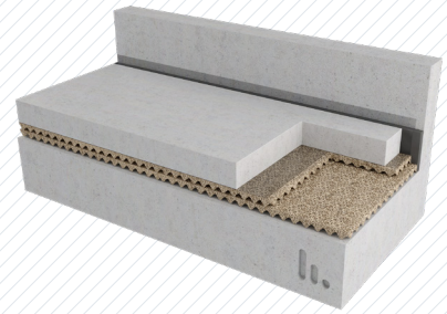
2 layers of Stravifloor Mat-W x

Version 2021/1 - All information provided in this document is subject to legal disclaimers. © CDM STRAVITEC N.V. 2021. All rights reserved.