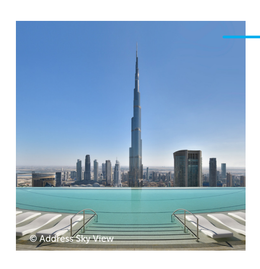
Address Sky View Dubai (UAE)