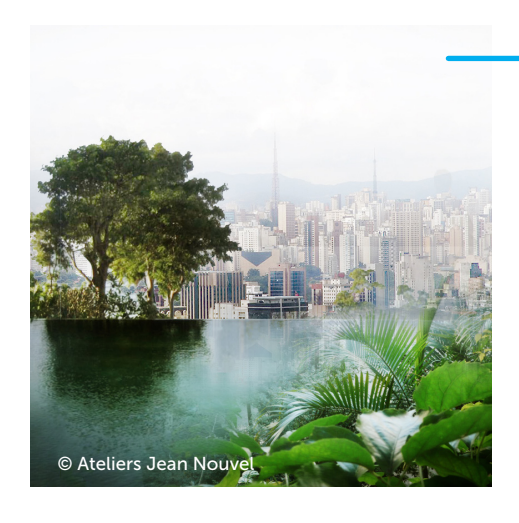
Rosewood Hotel São Paulo (BR)