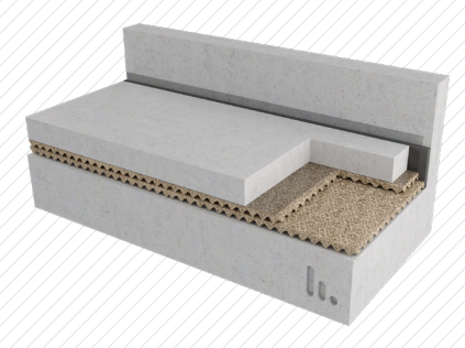
2 layers of Stravifloor Mat-W<sub>x</sub>