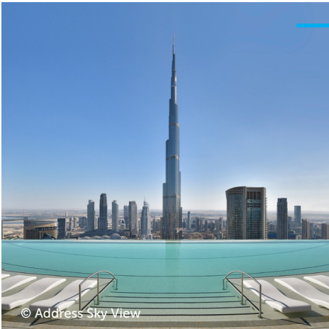
Address Sky View Dubai (UAE)