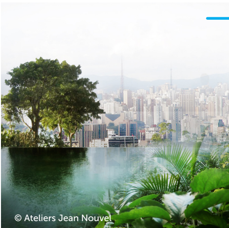
Rosewood Hotel São Paulo (BR)