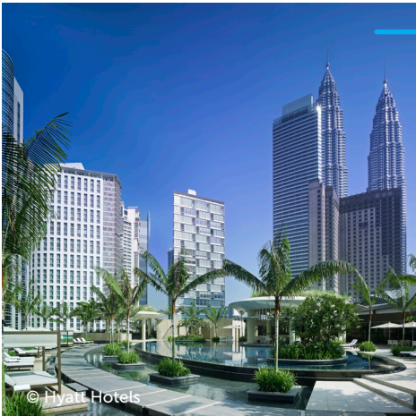
Grand Hyatt Hotel Kuala Lumpur (MY)

At CDM Stravitec, we take pride in the quality of work that we produce. Since the founding of our company in 1951, we have made many contributions to the intelligent design and noise mitigation of swimming pools, spas, and the mechanical components with our engineered products. Take a look at some of our latest projects carried out with well-known brands and reputable acoustical consultants.