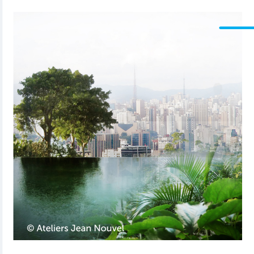
Rosewood Hotel São Paulo (BR)