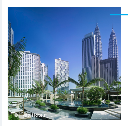
Grand Hyatt Hotel Kuala Lumpur (MY)

At CDM Stravitec, we take pride in the quality of work that we produce. Since the founding of our company in 1951, we have made many contributions to the intelligent design and noise mitigation of swimming pools, spas, and the mechanical components with our engineered products. Take a look at some of our latest projects carried out with well-known brands and reputable acoustical consultants.